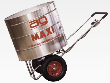
Lime kit optional

The Maxi is filled manually and then pushed or pulled by hand. The battery powers the conveyor and the agitator.